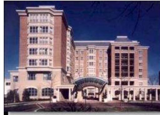
Marriott Brighton Gardens 80 locations nationwide