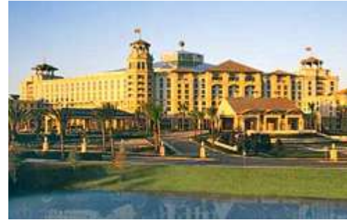
Gaylord Palms Hotel and Convention Center Kissimmee, Florida