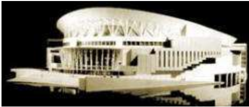
Olympic Coliseum San Juan, Puerto Rico