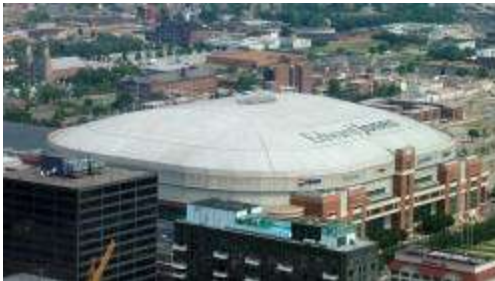
Edward Jones Dome St. Louis, Missouri

Multicom's customers and experience includes deploying over 3,000 headends, systems, and upgrades for virtually every conceivable type of commercial client and application, including: MDUs, hotel/motels, resorts, stadiums (including the Olympic Coliseum in San Juan, Puerto Rico), military bases, schools, universities, prisons, CATV operators, Telcos, hospitals, nursing/assisted living facilities, municipalities, state and federal government, DOT, International, and more