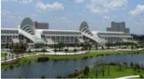
Orange County Convention Center Orlando, Florida