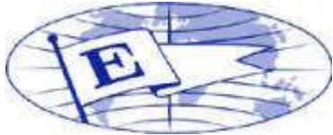
The US President's "E" Award for Exporters