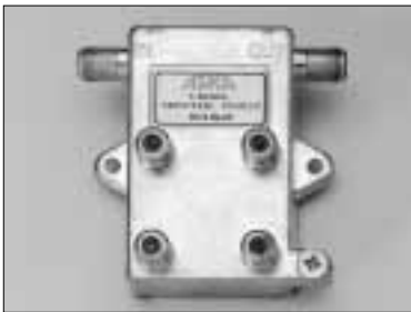
4-PORT DIRECTIONAL COUPLER DC41G - SOLDERED BACK COVER