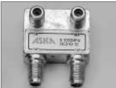
2-PORT DIRECTIONAL COUPLER DC21G - SOLDERED BACK COVER