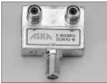
WALL MOUNT DIRECTIONAL COUPLER DCW1G - SOLDERED BACK COVER