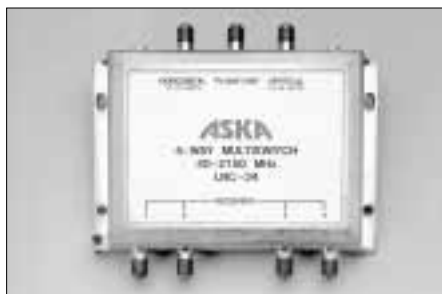
LNC-34 SATELLITE MULTI-SWITCH WITH AMPLIFIED UHF/VHF PORT