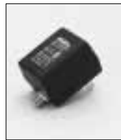
PS-9 F-port output 120 VAC - 24 VDC 600 mA