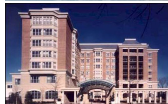
Marriott Brighton Gardens 80 Locations Nationwide