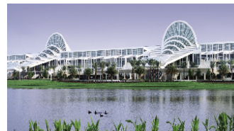
1,000,000 Sq. Ft. Orange County Convention Center Orlando, Florida

Multicom designs distribution systems utilizing AutoCAD and Lode Data software; the industry standard for drafting and design.