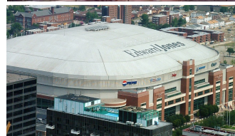
Edward Jones Dome Home of the St. Louis Rams St. Louis, Missouri