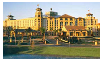
Gaylord Palms Hotel & Convention Center Kissimmee, Florida