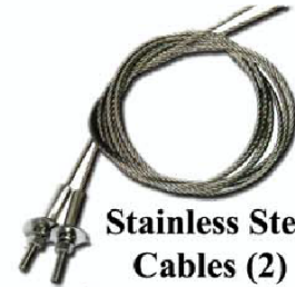
Stainless Steel Cables (2)