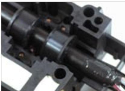
Multiple Layers of Sealing Protection