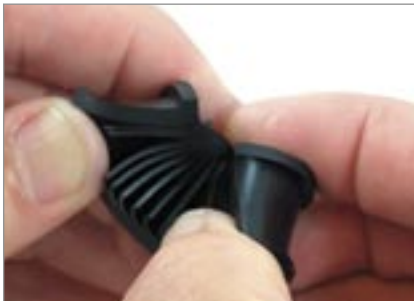
Expandable to Support Various Cable Diameters