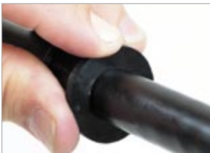
Ease of Installation - (no tapes, washers, or glue required)