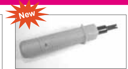
PDT-1 IMPACT PUNCH DOWN TOOL For use with terminal Block 110/88 With Impact adjustment. Punch & cut with reversible blade