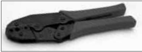
HXR-596 RATCHET HEX CRIMP TOOL For RG-58/U, RG-59U, RG-62 and RG-6/U connectors i.e. F-male, BNC, and TNC.