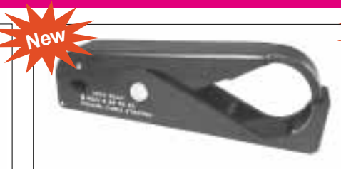
STR-3 SELF ADJUSTING BLADES - 2 Step Cable Stripper - w/ Replaceable cartridge - For RG-6, 58, 59, & 62 spare cassette (STR-3B) available from stock