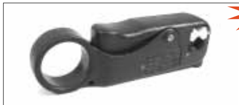
STR-1 COAXIAL CABLE STRIPPER For standard and Teflon, RG-59 and RG-6/U cable Adjustable blades (2-cut type) NOTE: Spare blades (STR-1B) available from stock