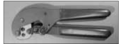
DELUXE HEX CRIMP TOOL AHX-360 .324 and .360 Hex For F56-342Q & F56-360 all F-59 & F-56 AHX-7 .413 Hex For F7-413 Connector