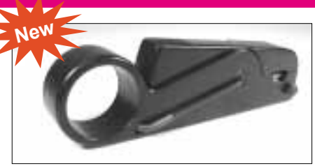
STR-11 Coaxial Cable Stripper For RG-11 - 2 Step Cable Stripper - w/ Replaceable blades - For RG-8, 11 & 213

SPECIFICATIONS SUBJECT TO CHANGE WITHOUT NOTICE