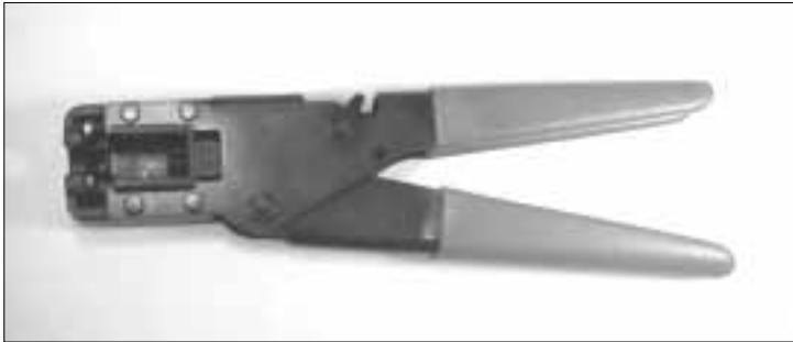
CTL-100 COMPRESSION RATCHET TOOL Compatible with most Compression type Connectors in the market, including Aska model FPL-56 and FPL-56Q Connectors