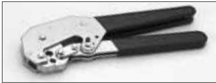
HEX CRIMP TOOL AHX-596 For RG-59/U and RG-6/U connectors AHX-11 For RG-11/U connector (ASKA No. AF-11C)