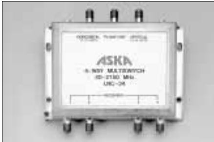
LNC-34 SATELLITE MULTI-SWITCH WITH AMPLIFIED UHF/VHF PORT