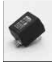
PS-9 F-port output 120 VAC - 24 VDC 600 mA