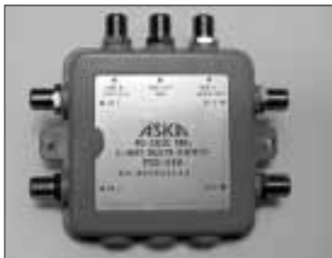
PDS-34M Mini 4-Way Multi-switch SIZE: 3-1/2"D x 4"W x 3/4"H