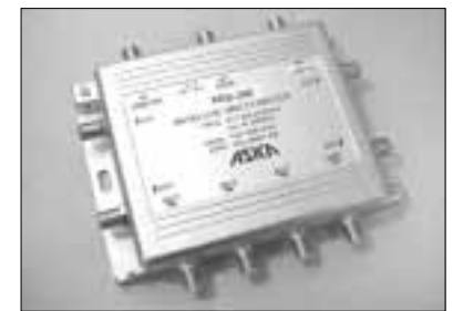
PDS-38X 8Way Multi-switch With Input Jack For External Power Supply Size: 5"D x 5-3/4"W x 1-1/4"H