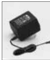
PS-6 & PS-6M 6 Ft. Power cable. 120 VAC - 24 VDC 600 mA