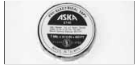
ET-60 60 Ft. Electrical Tape (3/4" x 60') Color: Black