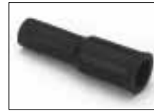
AWB-1 RUBBER BOOT For both RG-59 and RG-6 Cable