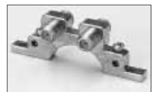
GB-3GD DUAL GROUNDING BLOCK with 2 groundingholes for dual cable system 25-28dB Return Loss-5-2300MHz

SPECIFICATIONS SUBJECT TO CHANGE WITHOUT NOTICE