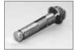
ANC-1 SLEEVE ANCHOR With Hex Nut (3/8" x 2-1/4") For heavy duty applications in solid concrete, hollow block and brick.