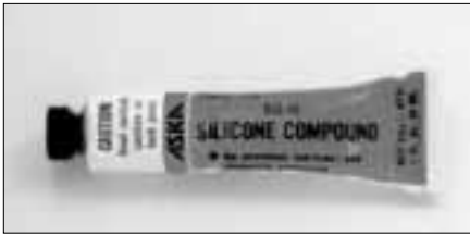
SG-10 SILICON GREASE - 3 Fluid oz.