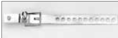
COPPER GROUND STRAPS A-24-6 - 6" Strap A-24-12 - 12" Strap