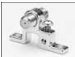
GB-1G GROUNDING BLOCK Brass Splice Cast Base using Circular Contact Pin 25-28 dB Return Loss 5-2300 MHz