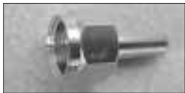
AF-59TB 75 Ohm AC/DC Blocked TERMINATOR