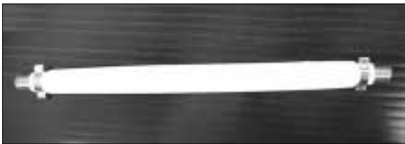
FC-8 8" Flat cable