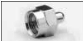
AF-59TIG 5-2150 MHz 25 dB Return Loss