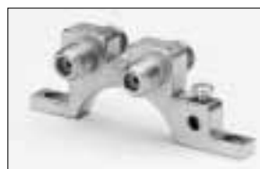
GB-2GD GROUNDING BLOCK with two Zinc Die-cast Splices using Circular Contact Pin 25-28dB Return loss 5-2300MHz