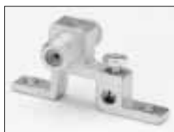
GB-1GD GROUNDING BLOCK Zinc Die-cast Splice using Circular Contact Pin 25-28dB Return Loss 5-2300MHz