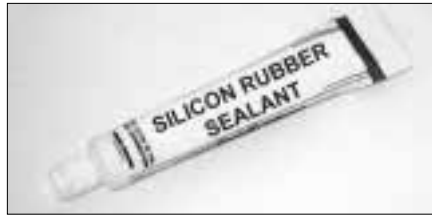
RTV-3 SILICON RUBBER SEALANT Clear, 3 Fl. Oz.