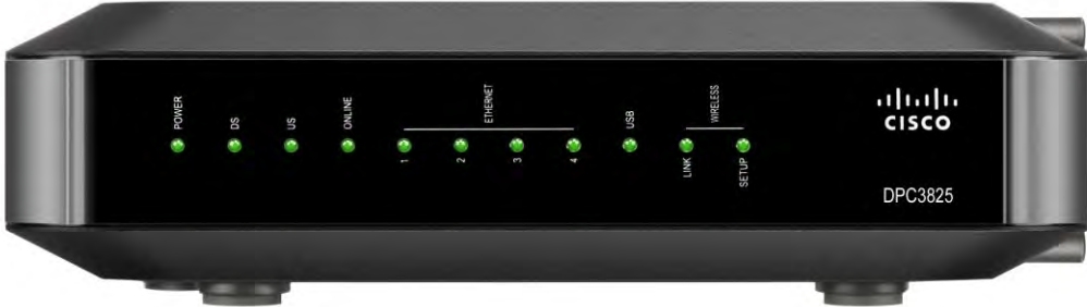
Table 1. Front Panel Features