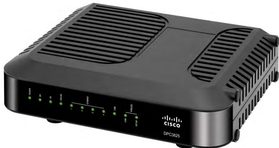
Figure 1. Cisco Model DPC3825 8x4 DOCSIS 3.0 Wireless Residential Gateway (image may vary from actual product and specification)

Designed for the active digital home or office, the DPC3825 integrated router features a Dynamic Host Configuration Protocol (DHCP) server, Network Address and Port Translation (NAT/NAPT) and a Stateful Packet Inspection (SPI) firewall. These features allow the user to share a single high-speed public Internet connection as well as share files and folders between devices within the home network by attaching multiple wired and wireless devices in your home or office to the wireless residential gateway.