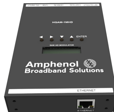
HQAM-1MHD LCD Panel Display

Set-up and administration of the HQAM-1MHD may be accomplished by either the LCD panel display or remotely by Ethernet connection and Web application.