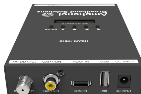
HQAM-1MHD Back Panel