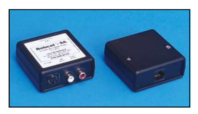
S-Video and Stereo Audio on Cat 5/6 Cable