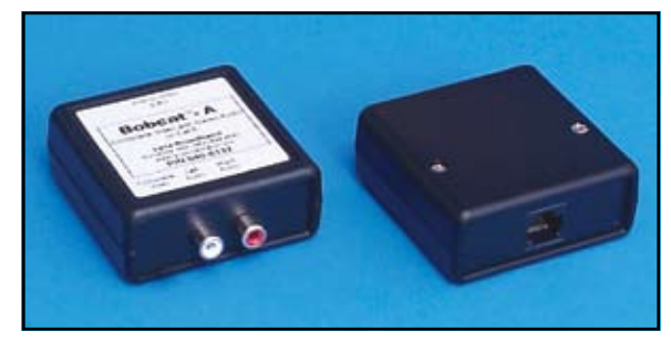
Stereo Audio on Cat 5/6

Bobcat<sup>™</sup>-CD: Delivers component video and digital audio on Cat 5 or Cat 6 cable. Excellent for sending HD programming from a cable or satellite set top box (or DVD) to a remote TV or projector. Distances to 200 feet with standard Cat 5/6 cable (330 feet with low skew cable).