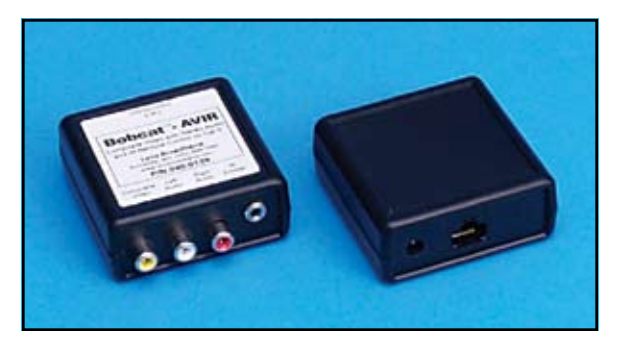
Composite Video, Stereo Audio, and Remote Control on Cat 5/6