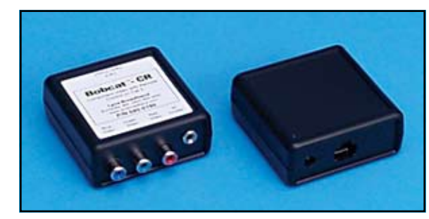
Component Video and Remote Control on Cat 5/6

Compatible with IR receivers, emitters, and power supplies made by Xantech and others including the Xantech® Dinky Link™, Micro Link™ and Hidden Link™ receivers and mini emitters equipped with 3.5 mm mini-plugs, and a 781RG power supply.