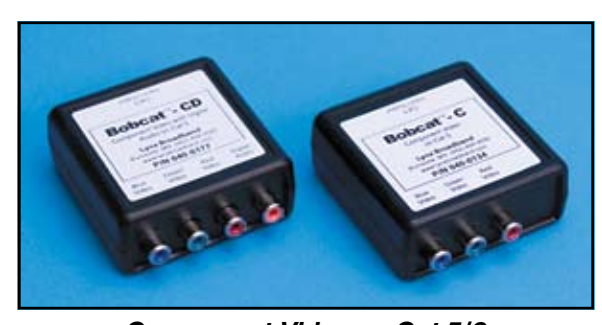
Component Video on Cat 5/6 with or without Digital Audio

PN L40-0177: RGB & digital audio PN L40-0134: RGB only (Bobcat™-C)