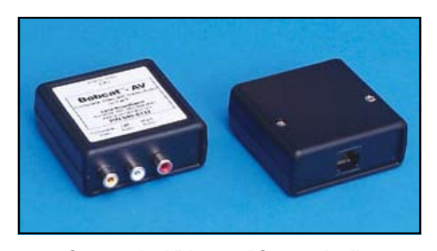
Composite Video and Stereo Audio, on Cat 5/6 Cable