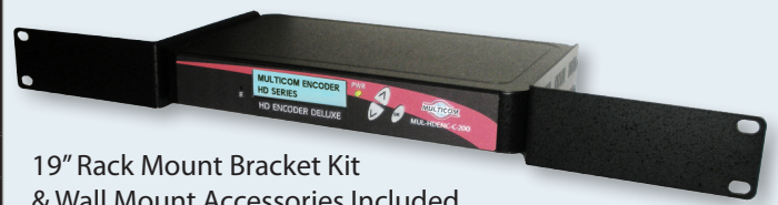
19" Rack Mount Bracket Kit & Wall Mount Accessories Included