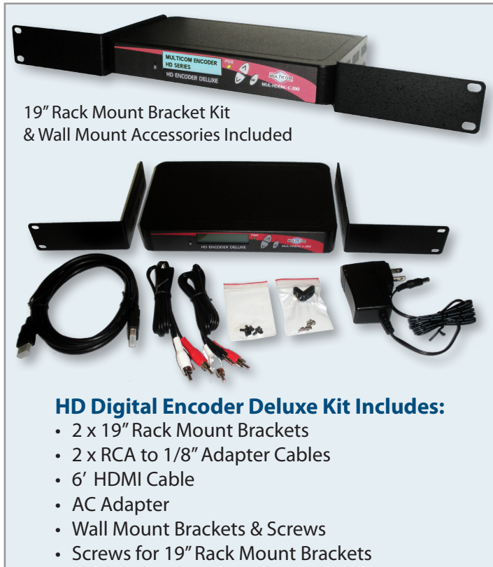
19" Rack Mount Bracket Kit & Wall Mount Accessories Included