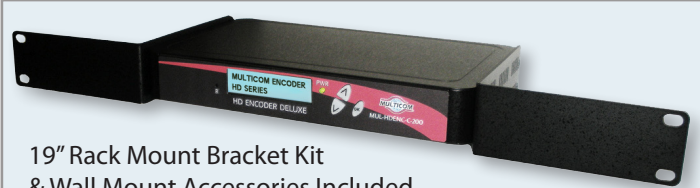
19" Rack Mount Bracket Kit & Wall Mount Accessories Included