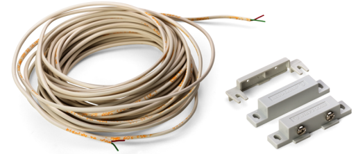
The door switch has four components: magnet, switch with screw-terminals, screw-terminal cover and connection wires.

This sensor offers a low-cost method to monitor access doors or cabinets that should remain closed. The non-contact magnetic switch mounts to the door of a server rack or equipment room and connects to a Goose climate monitor. Remotely check the door status through the web interface or use alarms to notify you if a door is open.