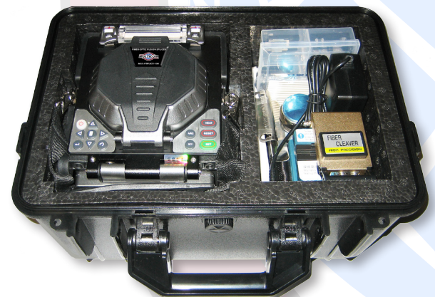
Fusion Splicer, Cleaver and all Accessories come in a Heavy Duty Carrying Case