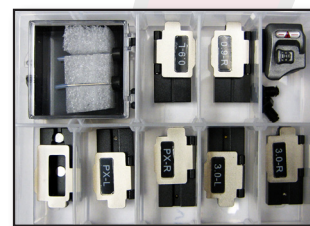
Fiber Optic Fixture/Clamp Set