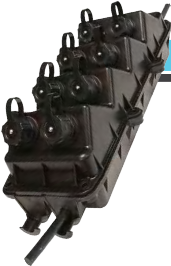
Patent in Process