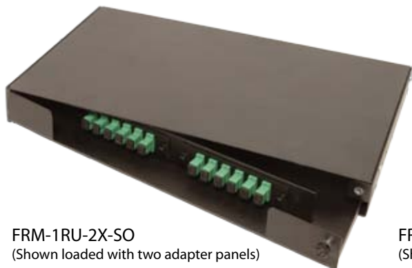
FRM-1RU-2X-SO (Shown loaded with two adapter panels)