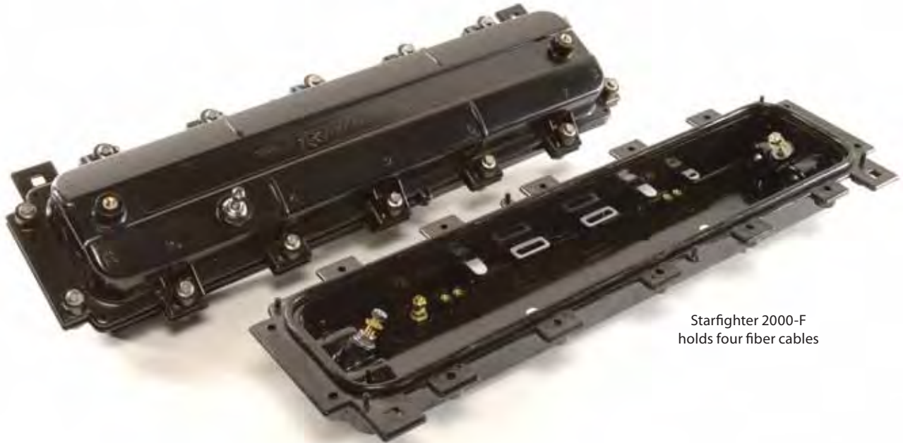
Starfighter 2000-F holds four fiber cables

The Starfighter 2000-F is a medium capacity fiber optic splice closure designed for a majority of splicing applications in above and below grade installations. The closure supports both aluminum and plastic splice trays and is fully gasketed to prevent the ingress of water while allowing for ease in entry. The unit is compact and manufactured with highly impact and corrosion resistant materials.