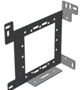
Universal Mounting Bracket Available Stock ID: 592-523-P1