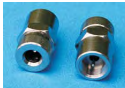
Optional "F" Connector Adapter