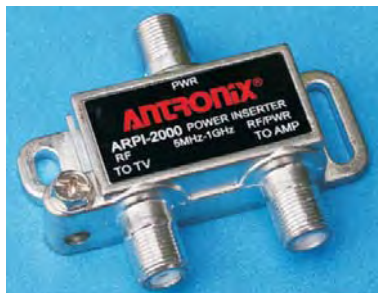
Optional Power Inserter

Approvals include UL, CE, FCC and the EMC requirements of FCC part 15.