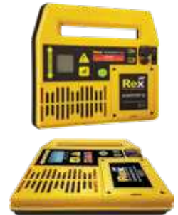
Slim, Sleek & Powerful Transmitter 3.5 lbs and 1.75" thick