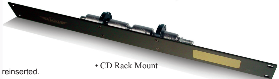
• CD Rack Mount