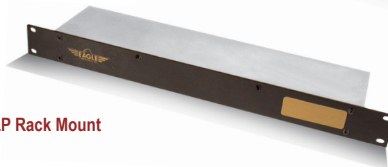
• EBWLP Rack Mount

Custom Brick Wall Lowpass Available Per Request.