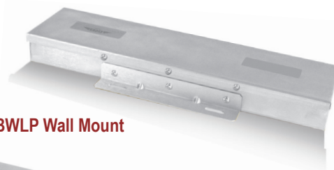
• EBWLP Wall Mount

Specifications subject to change without notice.